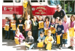
Lineboro Fire Station