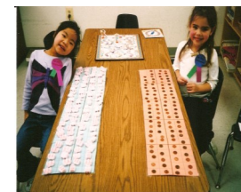
100 th Day of School

Math: Math concepts are taught using manipulatives, literature, special projects and work book lessons. Math is reinforced daily during our circle time activities.